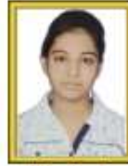
Vijay Laxmi Department of Secondary Education (Rajasthan)